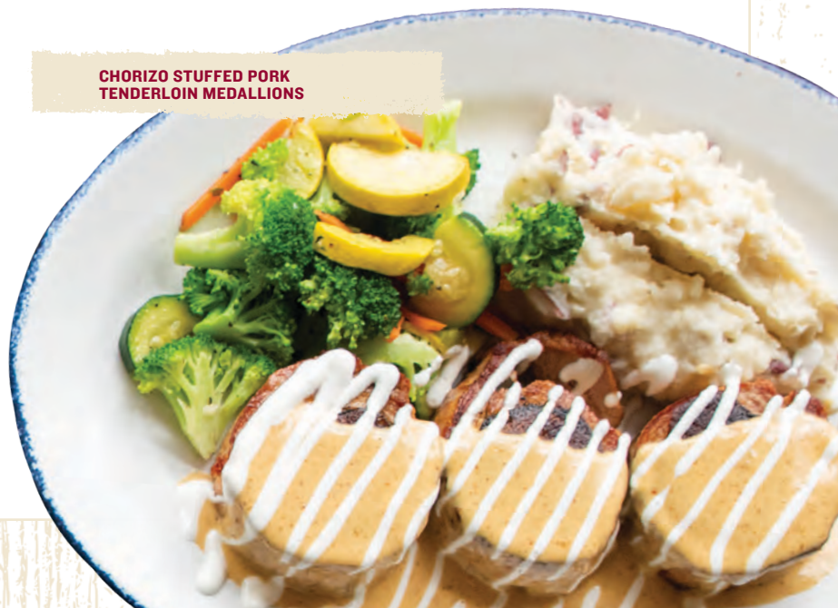
CHORIZO STUFFED PORK TENDERLOIN MEDALLIONS

*Consuming raw or undercooked meats, poultry, seafood, shellfish, or eggs may increase your risk of food-borne illness, especially if you have a medical condition.