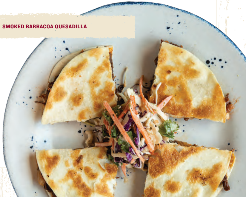
SMOKED BARBACOA QUESADILLA