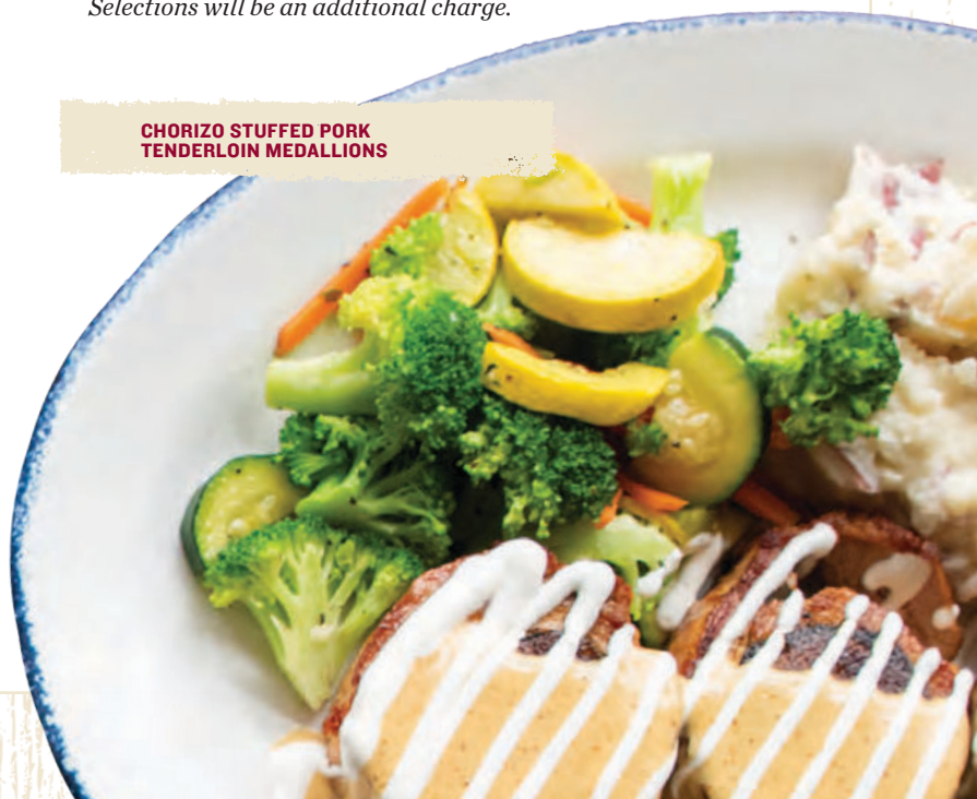
CHORIZO STUFFED PORK TENDERLOIN MEDALLIONS

*Consuming raw or undercooked meats, poultry, seafood, shellfish, or eggs may increase your risk of food-borne illness, especially if you have a medical condition.