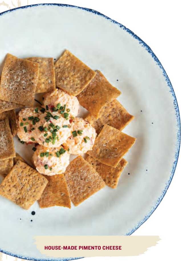
HOUSE-MADE PIMENTO CHEESE

walnut pesto cream sauce, grated parmesan, chipotle purée, grilled ciabatta bread