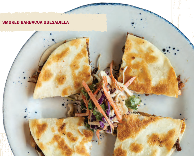
SMOKED BARBACOA QUESADILLA